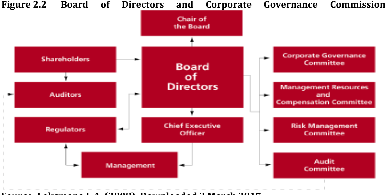
Figure 2.2 Board of Directors and Corporate Governance

Board size and firm performance are one of the focuses of board composition. Board size suggests that when the size of the group increases, individuals tend to put less effort. Having smaller groups may facilitate group cohesiveness.