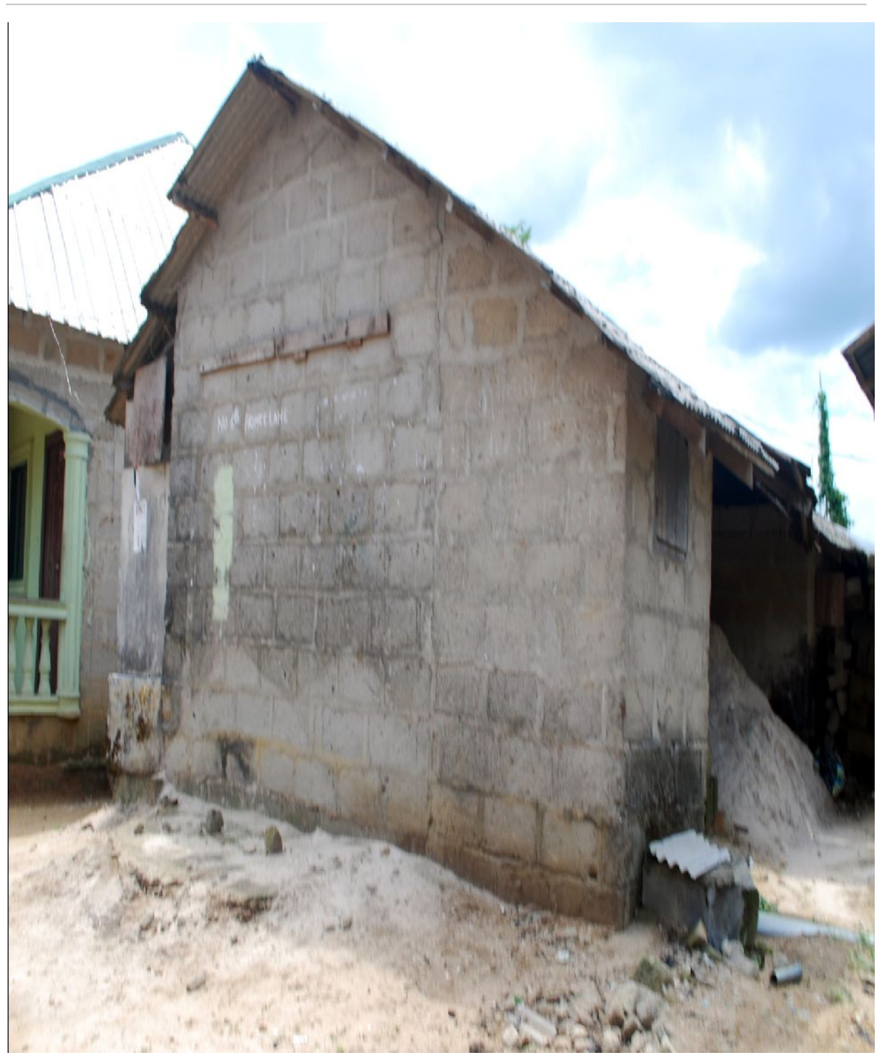
Fig. 3 a: Unpainted Building of the Study Area