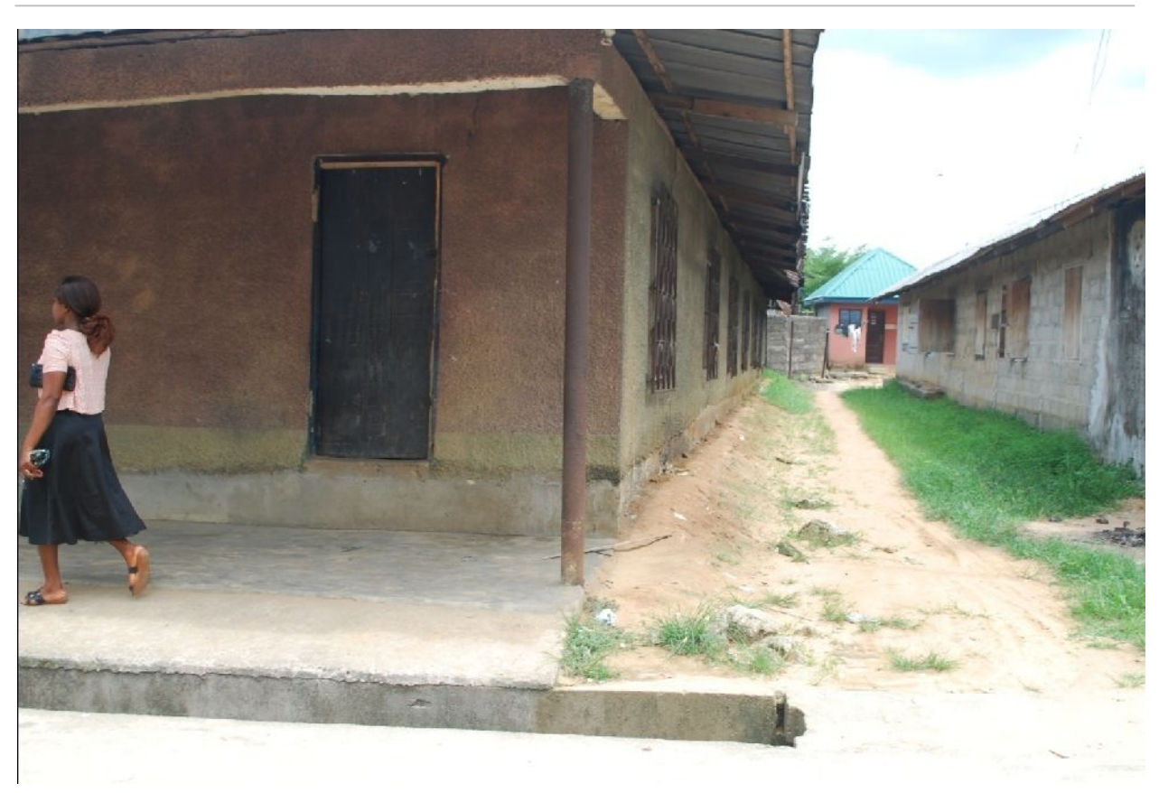
Fig. 3b: An Aged Painted Wall of Residential Building in the Study Area

The roofs of the buildings were mostly corrugated iron sheets (78%) which are strongly affected by lead and subjecting them to rust more especially as the study area is located within the coastal zone were the South West Winds easily blow the Atlantic particles and deposit in the area. Deposition of these particles on the roofs of these buildings results in rusting (see fig. 4 a and 4b).