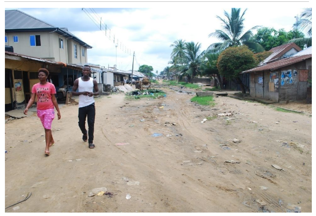
Fig. 5 b: Unpaved Sampled Street Subject to Periodic Flooding

Street lighting is completely out of the reach of the area as over 95% of the respondents revealed that they had never seen street light in Bori.