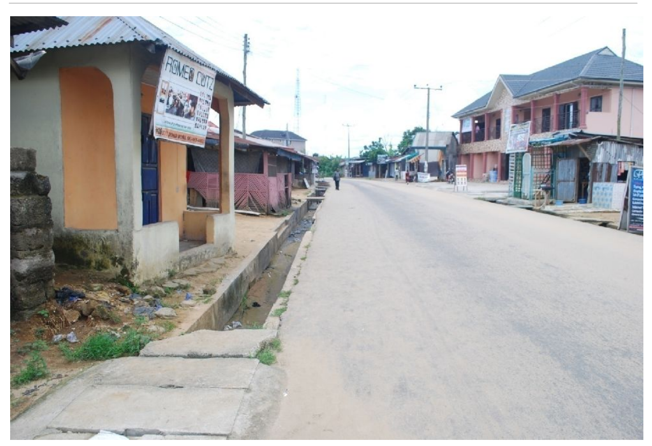
Fig. 2: Buildings without Setbacks

A strong sign that the buildings were not properly planned and do not respect any town planning standards in terms of setbacks, percentage of built up area, height of buildings, sizes of rooms, and occupancy ratio etc. Thus, most of the buildings (93%) do not possess appropriate planning permits from the town planning authority of the local government council and even the zonal town planning office. Most of the buildings were unpainted and even the painted ones were observed to be over twenty years (see fig. 3a and 3b).