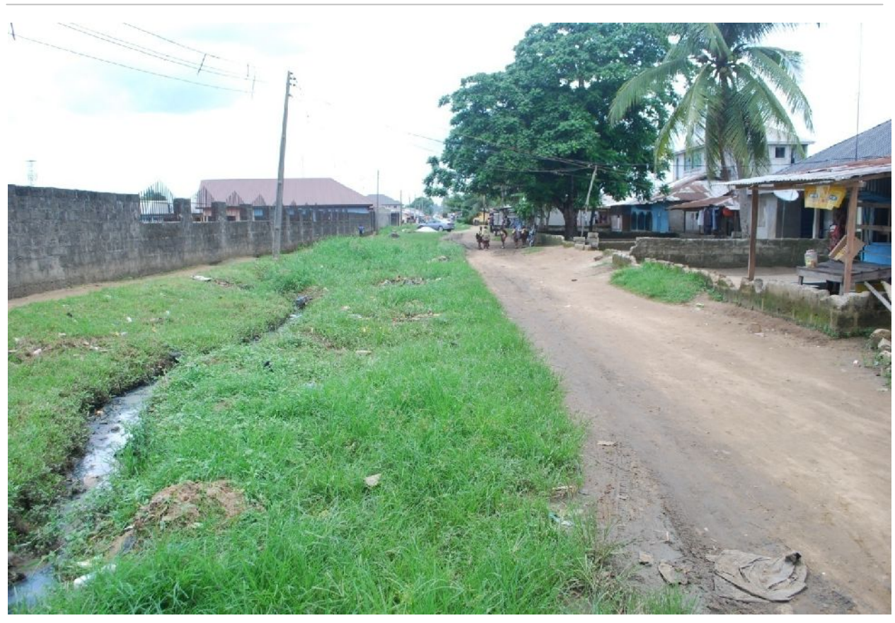
Fig. 5a: Ineffective Drainage on Gokana Street of the Study Area