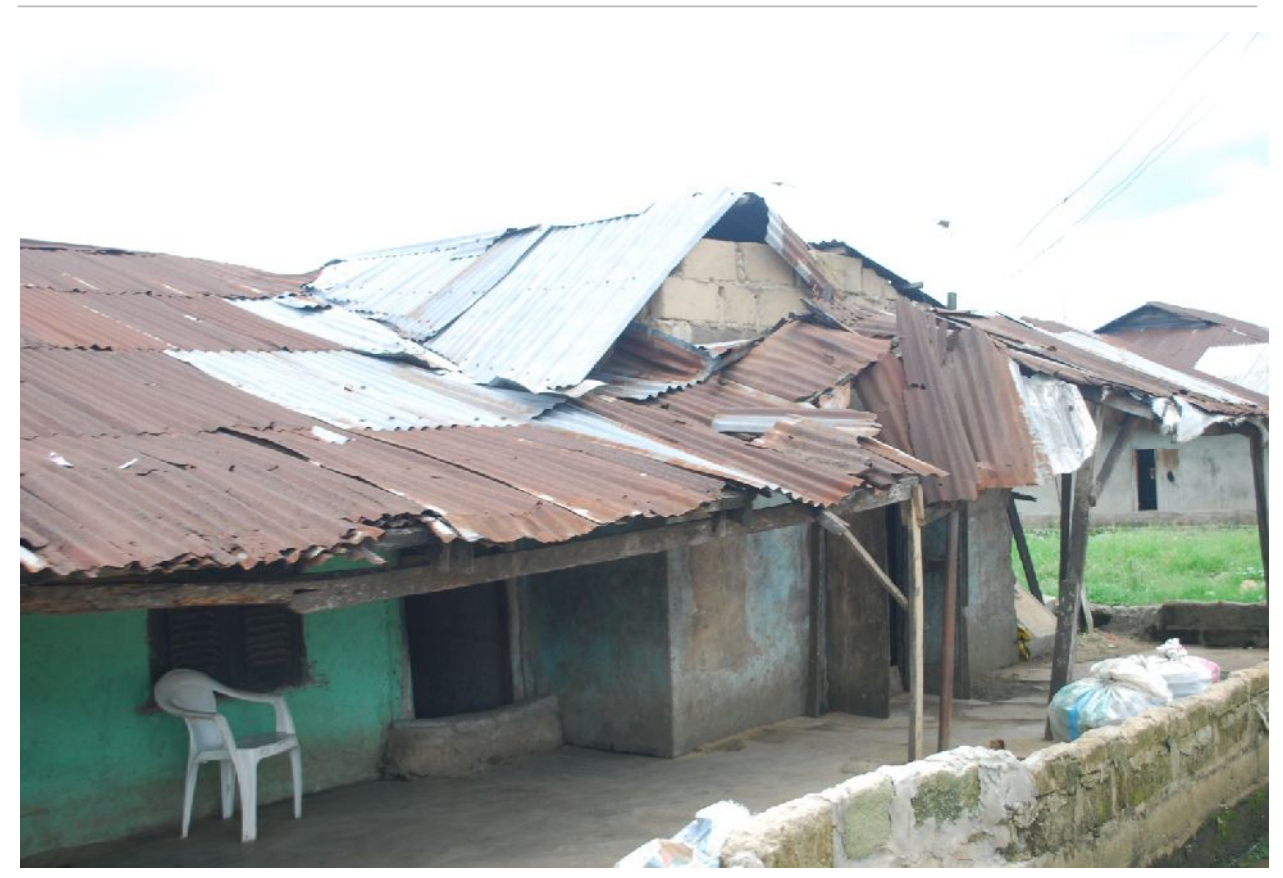
Fig. 4b: Blighted Residential Building on the Sampled Street

Also, the respondents revealed that the area experienced periodic flooding (76%) especially after heavy rainfall as most of the streets do not possess functional drainage system (see fig 5 a and 5b).