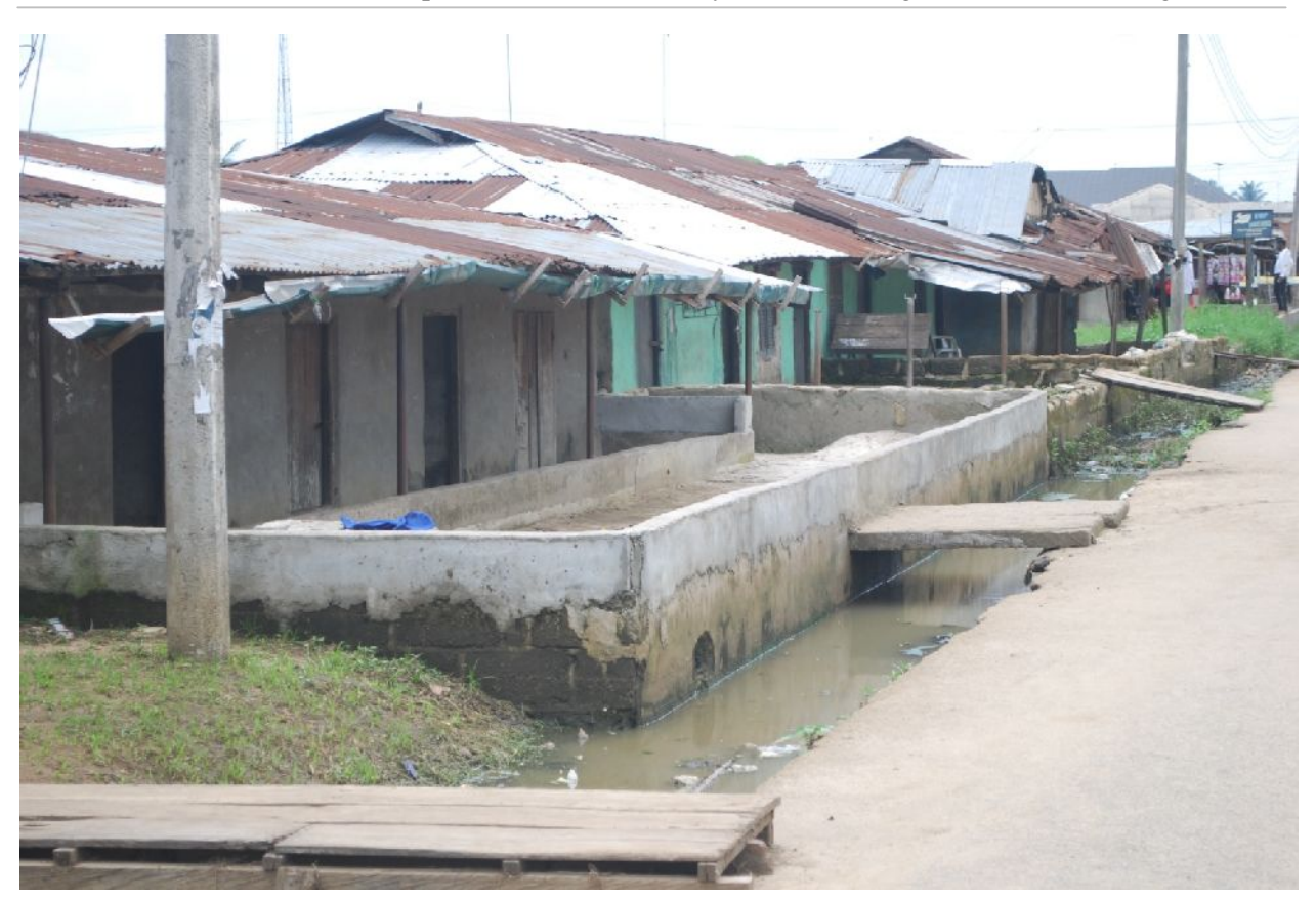
Fig. 4 a: Rusted Building Roof in the Study Area