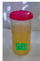
Rice like watery stool sample