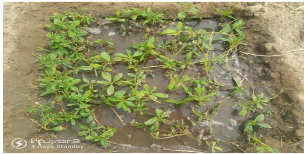
Plate 2: lysimeter showing Waterleaf Crop