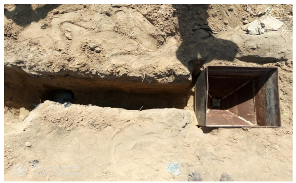
Plate 1: Installation of a Lysimeter