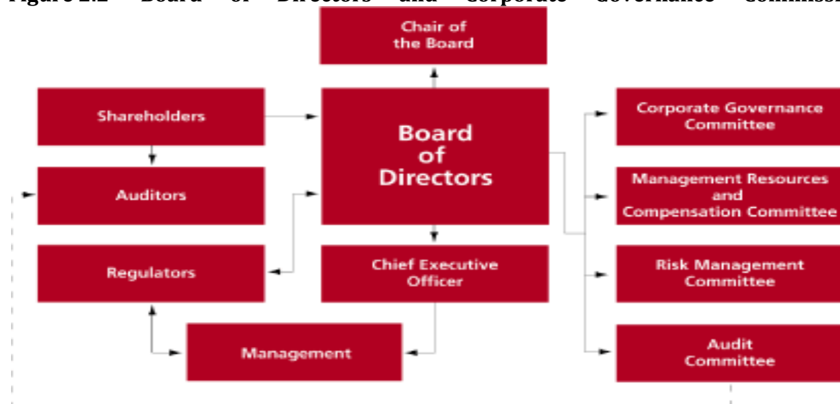
Figure 2.2 Board of Directors and Corporate Governance Commission